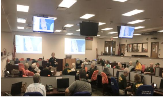
Marion County Sheriff's Office Division of Emergency Management Emergency Operations Center