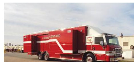
Proposed MCSO type of new Mobile Command Center.

A long-term project for MERT is identifying radio equipment for the proposed new Mobile Command Center (MCC). The Sheriff's Office plans on replacing the current 52 ft trailer with a more mobile version built on a large chassis used for fire ladder trucks.